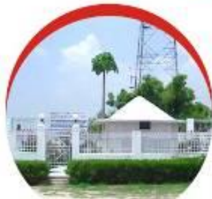
Brahma Vidya Tapasthali