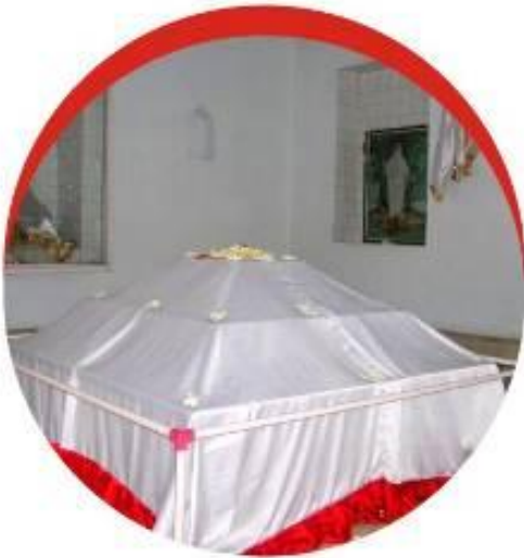
Samadhi Sthal (The Holy Grave): Samadhi of Shri Sadguru Sadafaldeo Ji Maharaj