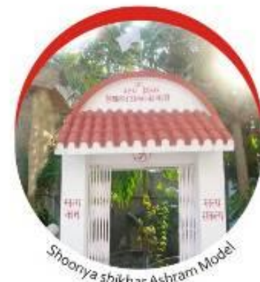
Shoonya shikhar Ashram Model