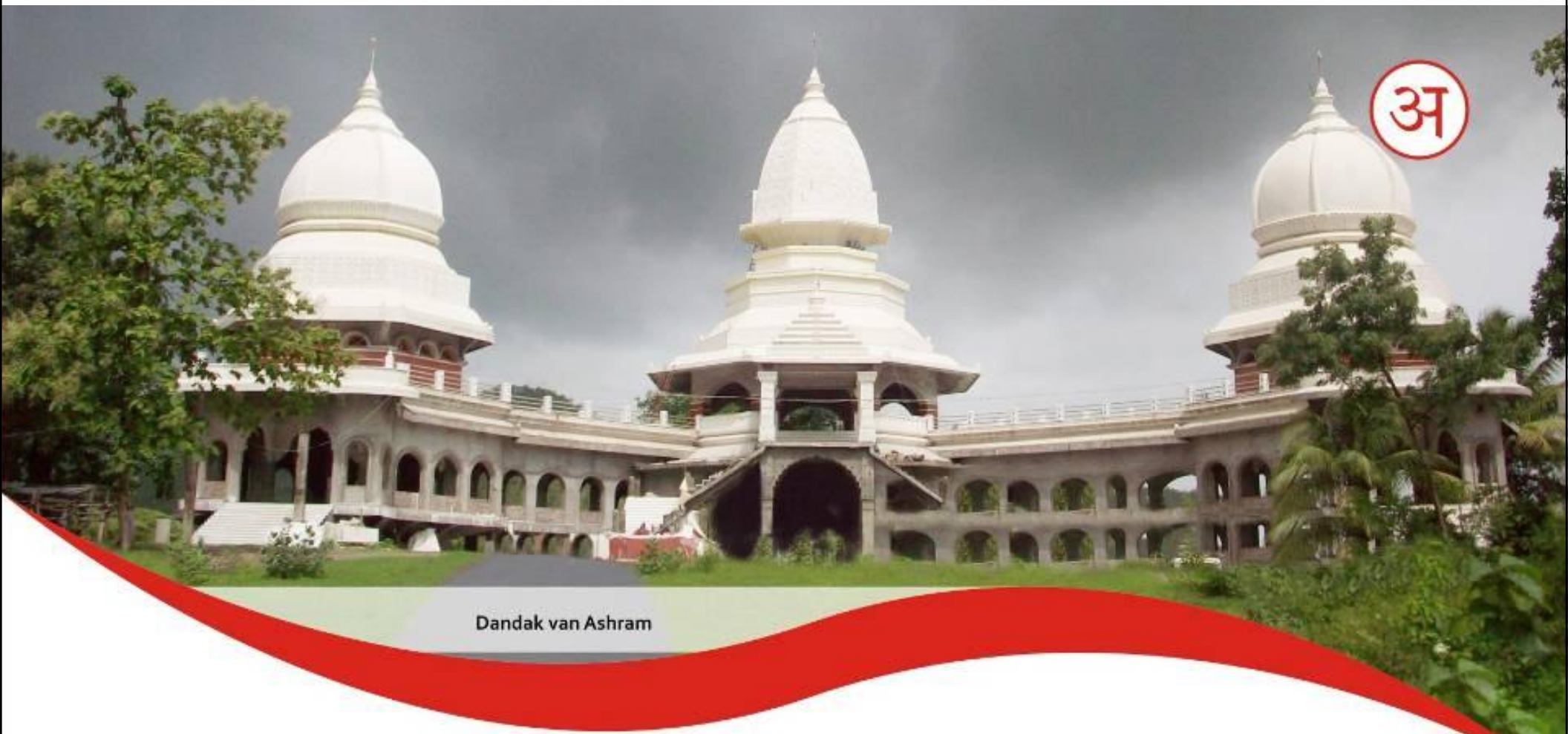
Dandak van Ashram