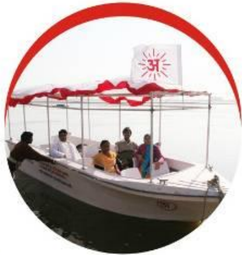
Triveni Sangam View: View of the holy tri-junction (Triveni Sangam) and boating facilities.