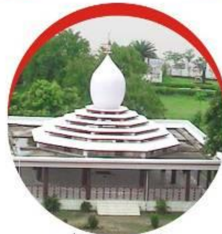
Yagya shala View